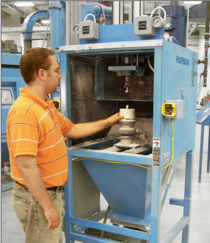
Knock out station with specially designed apparatus and integral dust hood reduces dust created during the plaster knock-out process, preventing equipment problems and improving the work environment.

by keeping our facility clean and quiet we're improving employee retention and perception," says Hohenstein.