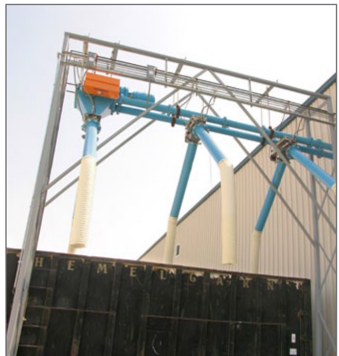
Discharge end of the 400 ft (122 m) tubular drag conveyor. Each discharge has a bi-directional gate.

In addition to reducing noise and dust, the new system was also engineered to create other benefits. Added safety features reduce the risk of employee injury at the knock-