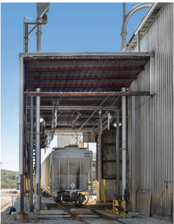
Carry and return sides of conveyor on either side of pit.

was totally inadequate for the goals of the system and the rates required." Several Venture engineers had experience with Hapman and the Tubular Drag Chain Conveyor for use in applications with demanding variables. Due to the schedules of product delivery, and the inadequacy of their existing system, Dyno Nobel was "truly in an emergency mode to find the right solution," stated O'Connor.