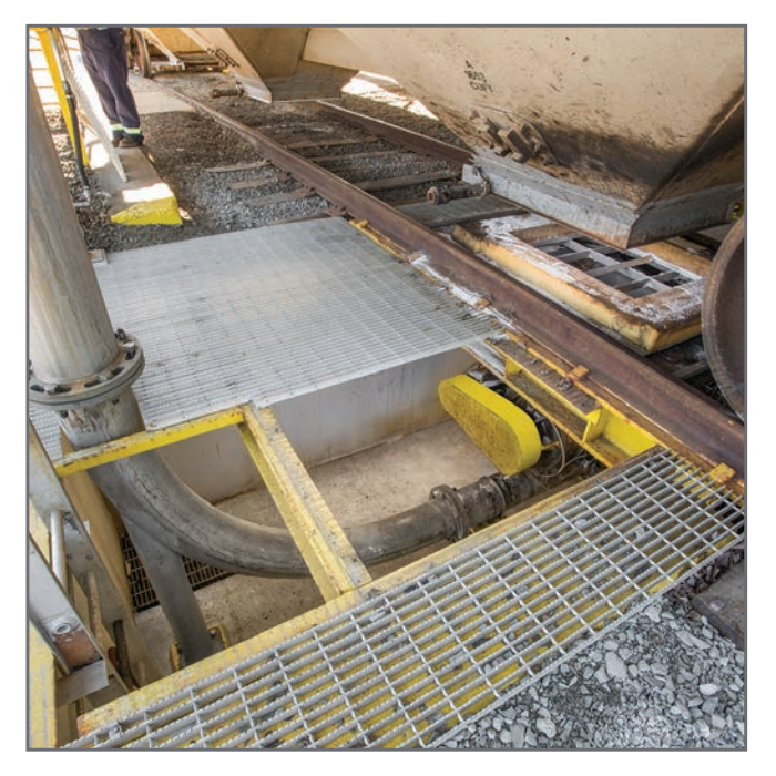
18" rotary feeder control feeds the prill into the Tubular Drag Conveyor.