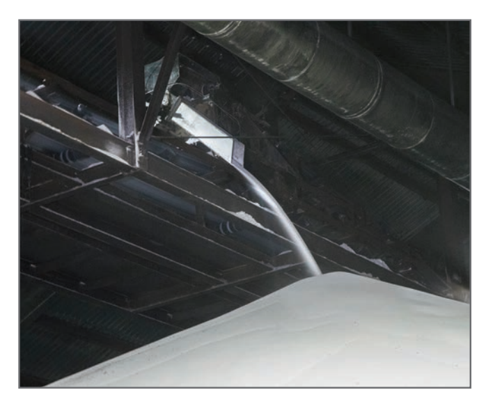
The prill is discharged into the storage facility.

"Hapman and their local representative worked very hard to ensure the successful completion of our client's project," stated O'Connor. "Their efforts helped identify and implement the optimum solution in order to meet our client's needs on schedule, scope, and budget."