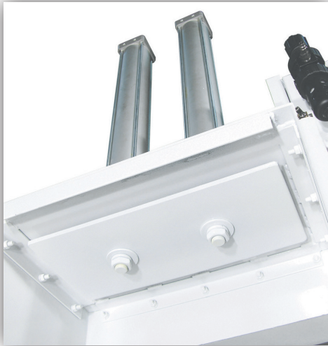
Dual pneumatic rams and sturdy compaction plate compress bags consistently and efficiently.