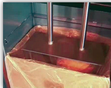
Watch the bag compactor in action at hapman.com/compactor