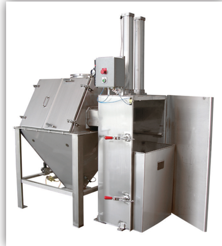
Attach bag compactor to a Hapman bag dump station for maximum dust containment.