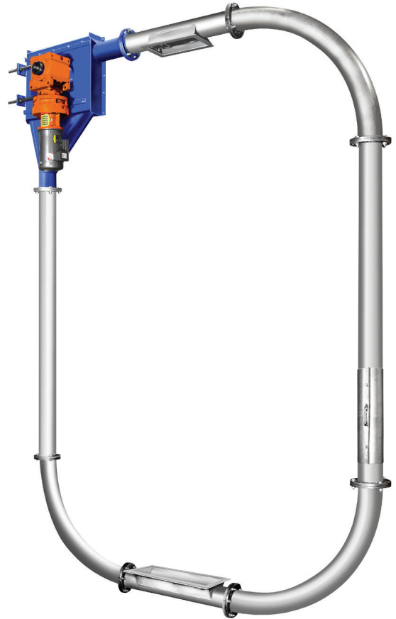
The fully enclosed tubular drag conveyor consists of a stationary outer casing through which a chain is pulled by a sprocket drive.

The typical tubular drag conveyor is operated by a single, low-horsepower electric motor, making it one of the most energy efficient methods of conveying. The slowmoving, positive displacement action of the chain assembly is ideal for handling friable and/or blended materials without separation or degradation. The slow movement also assures long conveyor life, dependable service and minimal noise levels with the ability to operate continuously or intermittently.