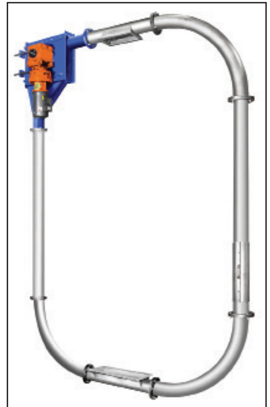
The fully enclosed tubular drag conveyor consists of a stationary outer casing through which a chain is pulled by a sprocket drive.

While similar in some ways to cable and aero-mechanical style conveyors, tubular drag technology is superior to these systems in that it utilizes a heavy-duty chain to move material at a low velocity. The result is a conveying method that is rugged, yet gentle for the widest array of materials with virtually no maintenance and low power consumption.