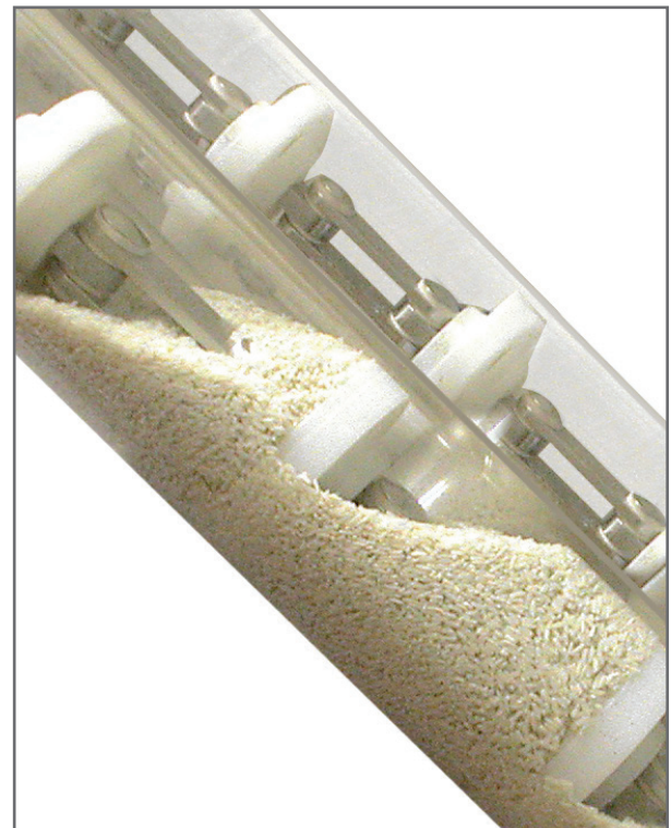
The tubular drag conveyor consists of a stationary outer casing through which a chain is pulled by a sprocket drive. Flights are attached to the chain at regular intervals and pull material from infeed points to discharge points as the assembly moves through the casing.

The casing can be manufactured of carbon or stainless steel pipe in sizes ranging in diameter from 3 to 12 inches