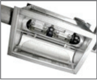
In a self-cleaning discharge gate, the lower portion of the conveyor casing is cut away. The cut out blank is retained and hinged in and out of position to open and close the discharge gate.

(76 to 305 millimeters) or greater and utilize special liners, when required. Casing sections are supplied in lengths as required by the conveyor path.