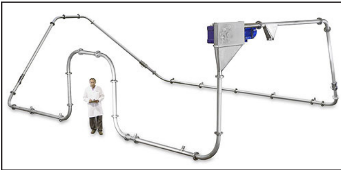
Configure the tubular drag to convey product vertically, horizontally, at any angle and around corners. Inlets and outlets can be configured where needed

Numerous inlet hoppers may be incorporated into a single conveyor to flood feed the unit as the chain assembly passes each opening. Likewise, the conveyor can have multiple discharge points. As such, a single tubular drag conveyor can replace multiple conveyors. To provide selective discharge points with circuits that include multiple discharge points manually or pneumatically operated gates may be used. While conventional knife gates can be used for this purpose, it is more practical to use a self-cleaning discharge gate. The lower portion of the conveyor casing is cut away and reattached into position to open and close the discharge gate.