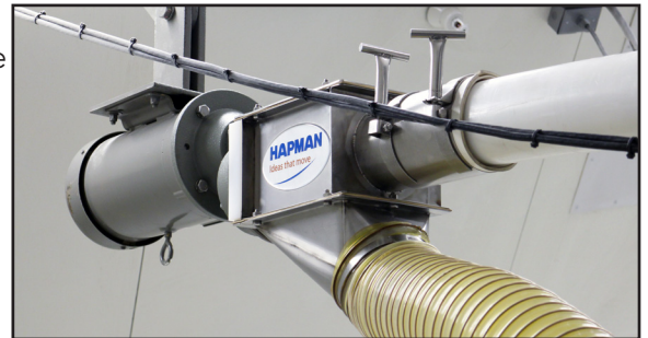
Helix conveyor motor suspended from a trolley mounted to the ceiling at the Guixens Food Group plant in Tampa Florida.

The Hapman Helix is also at the center of Guixens innovative process improvement for the Tampa facility where operations are set up in a series of work stations; each packaging a specific dry bulk material. Inspired by how meat packing plants use a trolley to easily move product about the facility, Guixens designed his own trolley system that suspends the Helix motor from the ceiling. The trolley allows employees to use a single flexible screw conveyor for multiple stations, moving it quickly from one machine to the next with very little effort.